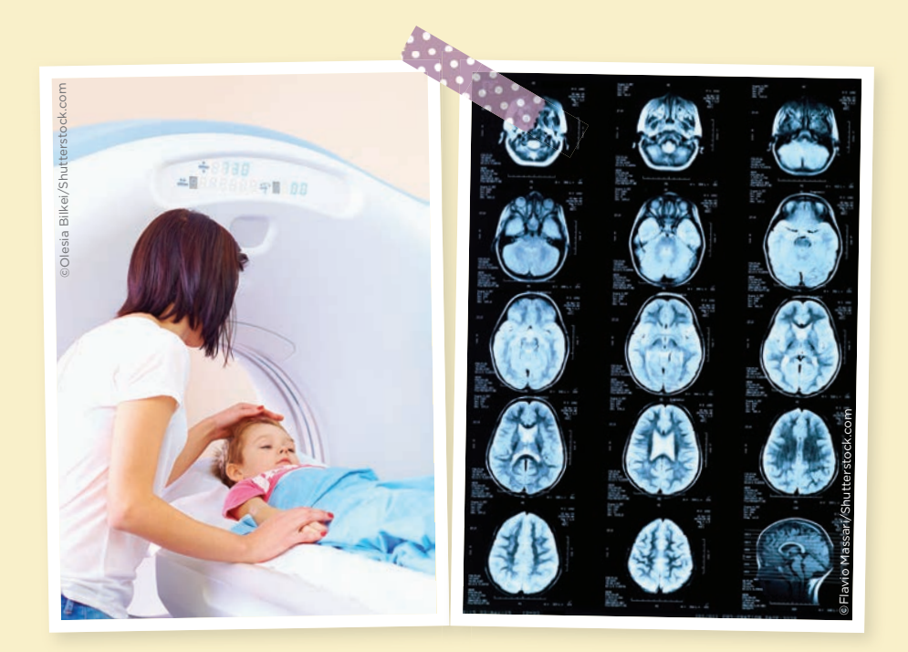
Your child will need to have a brain scan following diagnoses - either a CT scan or MRI

'There are at least 200 known conditions affecting the brain that can lead to infantile spasms'